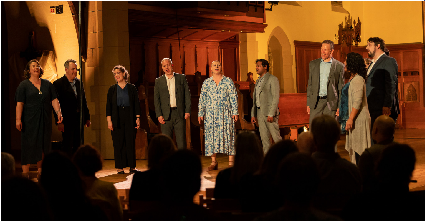
(re)birth