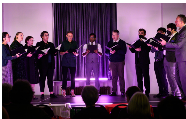
Hiraeth