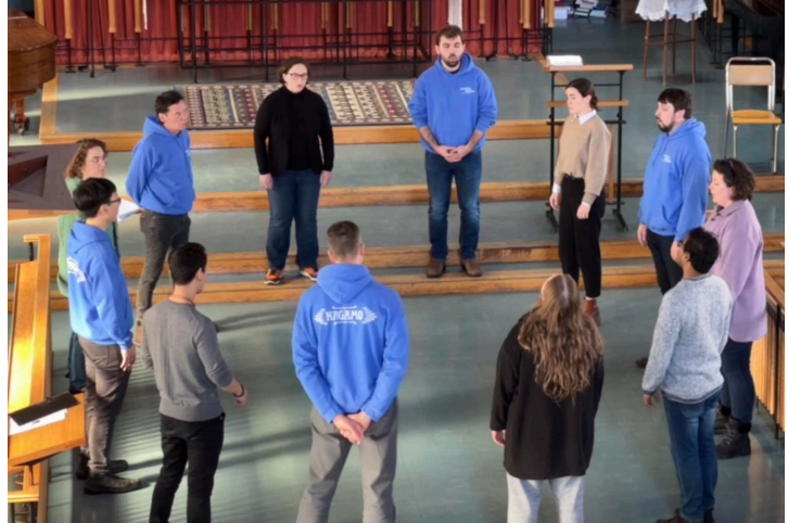
Top left: Our very first workshop at Havergal College in Toronto