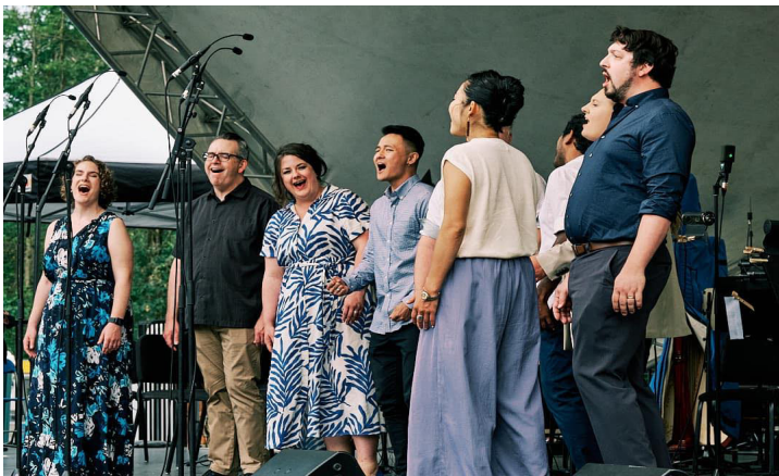
Performing in the pre-show for Vancouver Opera's Opera in Deer Lake Park