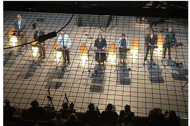
Performing Erin Gee's Song of Seven, presented by Vancouver New Music