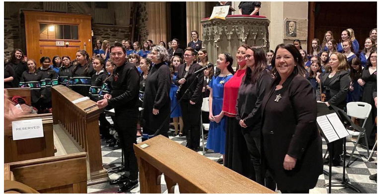
Bows after the performance with Shallaway Youth Choir St John's, NL